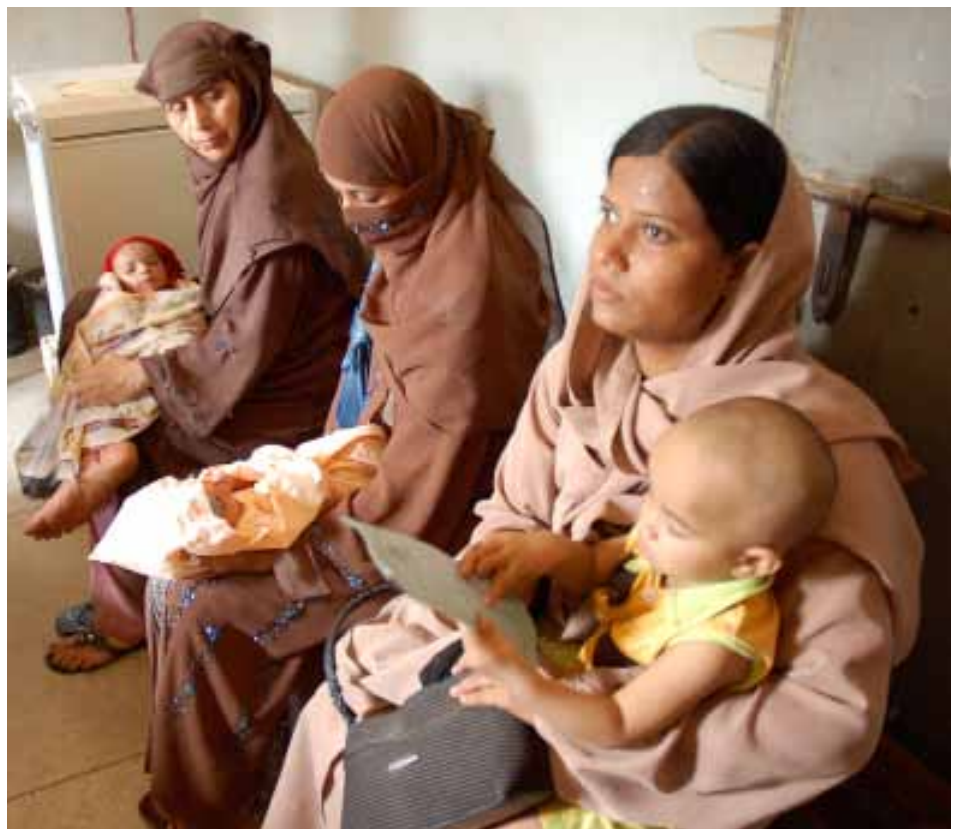
Women wait to have their children vaccinated at an immunization center in Karachi, Pakistan.