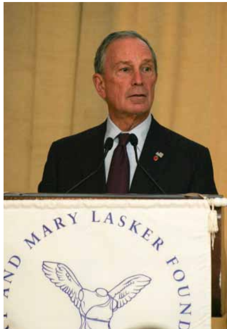
Lasker Laureate: Mayor Michael R. Bloomberg

When Mayor Bloomberg proposed the tobacco regulations in 2002, it ignited a firestorm of opposition from smokers, restaurant and bar organizations and others. They argued in part that the regulations would drive away customers. (In fact, business increased following the smoking ban.) "I got a lot of one-finger waves in parades, particularly when I went by bars, but today, it's inconceivable in New York that they