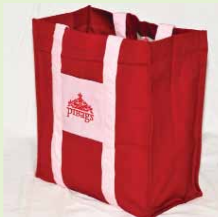
Sewing seeds of transformation: Pi Bags

2002, she started a pilot project in Baltimore to investigate whether teaching drug-using women involved in the sex trade how to make, market and sell jewelry could reduce their risk of contracting HIV. The women sold more than $7,000 worth of jewelry and reduced their number of sexual partners from a monthly average of nine to three.