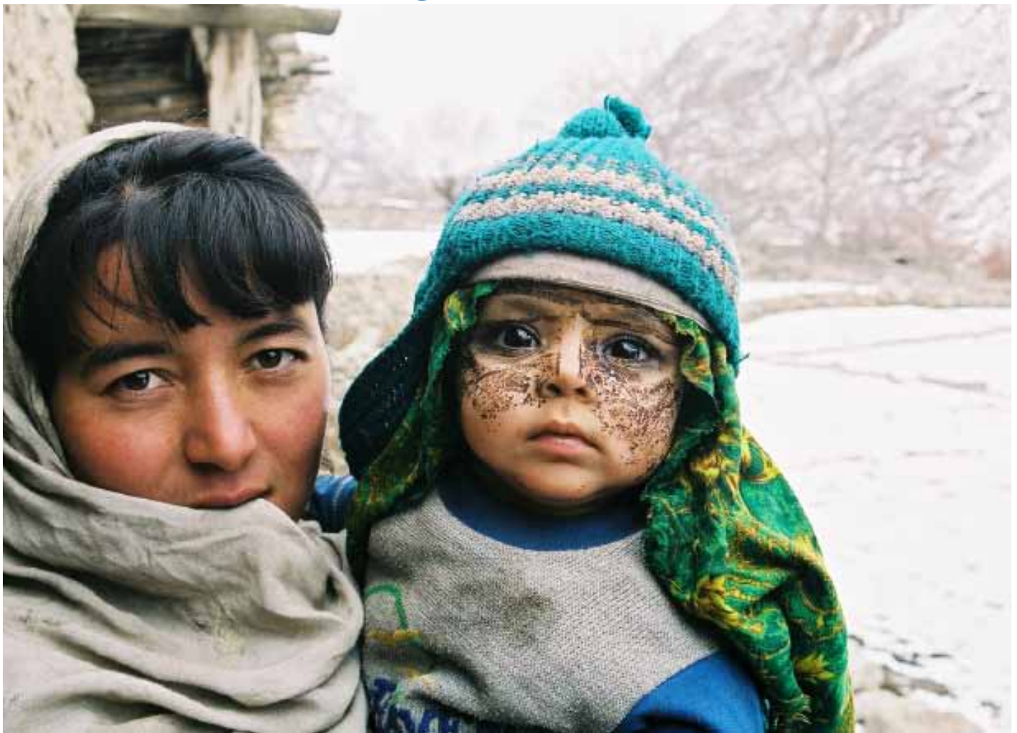
A mother holds her son—who wears a paste on his face as protection from the cold—in north Pakistan, the former site of a pneumococcal vaccine trial.